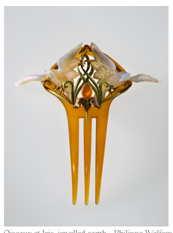
Oiseaux et Iris jewelled comb - Philippe Wolfers