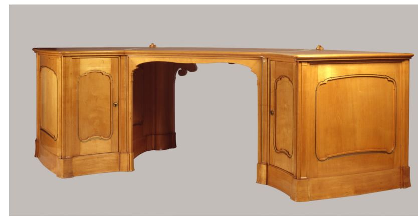
Office furniture - Victor Horta