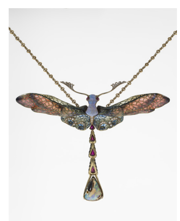
Libellule pendant - Philippe Wolfers