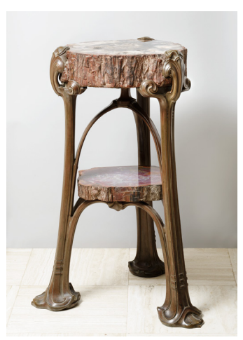
Tripod pedestal table - Victor Horta