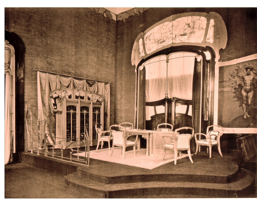
Dining room - Victor Horta