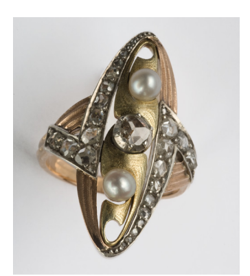
Ring - Henry van de Velde